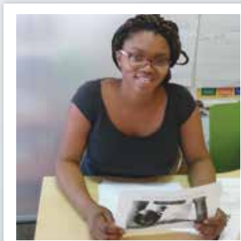
CONGRESSIONAL HUNGER CENTER

Funding to Feeding America at the national level recently included support for the Backpack Program at ten food banks in places with the highest rates of child food insecurity.