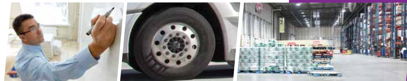
EXPERTISE IN TECHNOLOGY / LOGISTICS / WAREHOUSING

Edsung, which specializes in bakery and restaurant supplies, was consolidated into the Hansen Distribution Group.