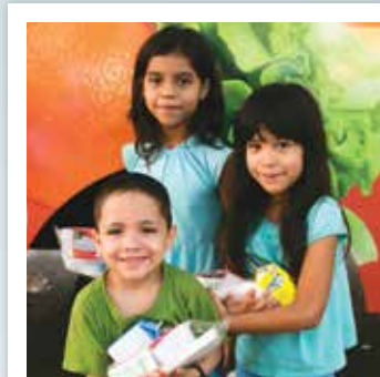
SHARE OUR STRENGTH/ NO KID HUNGRY

With the most recent financial contribution from C&S, the 23 rd class of Bill Emerson National Hunger Fellows will conduct six months of field work in six states at 11 community-based organizations.