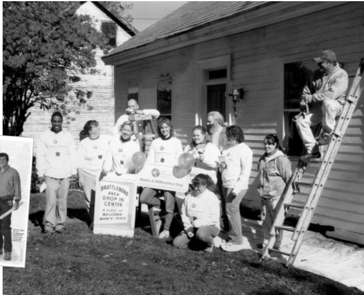
C&S employees in Brattleboro, Vermont, on Make a Difference Day. Their efforts, as well as those of C&S employees in Harrisburg, Pennsylvania, were commended in USA Today .

In both cases, C&S was quick to respond. Within hours of each storm, C&S employees had loaded up a tractor-trailer truck full of water to be donated to America's Second Harvest for transportation to the storm-ravaged areas. America's Second Harvest works directly with the Federal Emergency Management Agency (FEMA) and also partners with the American Red Cross and the Salvation Army to bring help where it's needed during national disasters.